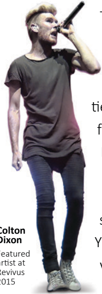
Colton Dixon Featured artist at Revivus 2015

The Official Revivus Event Program is put together to reach an event audience of approximately 5000 attendees to our annual Summer Outreach Concert Event featuring award-winning musical artists, vendors, and kids activities. This event draws families and individuals ranging in age from 5 to 55+ years old, representing a diverse market. Every single person in attendance will be personally handed an official program to keep with them well beyond the event date. Your ad has the potential to reach thousands of potential customers at a very cost effective rate. Your ad is also a generous donation to the ministry of Revivus, a California non-profit 501(c)(3) organization. You will be helping to make a difference in the lives of troubled youth struggling with the grip of addiction. A portion of all proceeds goes to Teen Challenge. Learn more at www.teenchallenge.org .